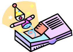
How to make a Pop-Up Card.