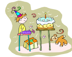
When I was one I was just begun ...